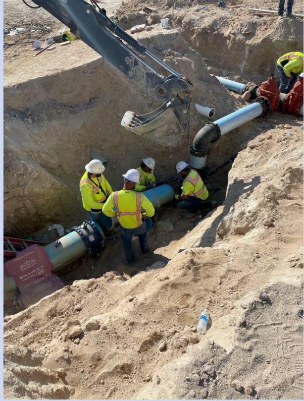
Affixing all the parts together