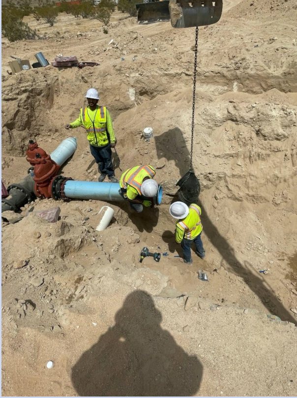
Staging for the Tilford "transmission main tie-in"