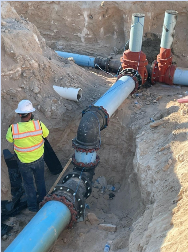
Accommodating an elevation change of 3 1/2ft.