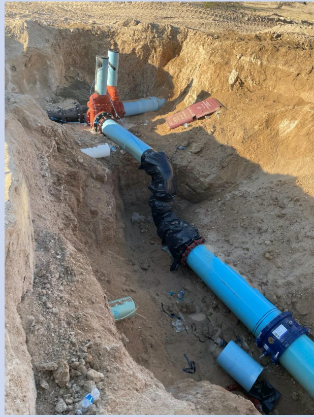
Protective wrapping of numerous "joints"