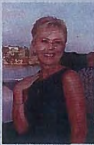
(Daughter's wedding photo)