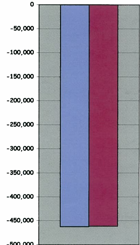
Net Increase (Decrease) February 2009 February 2010